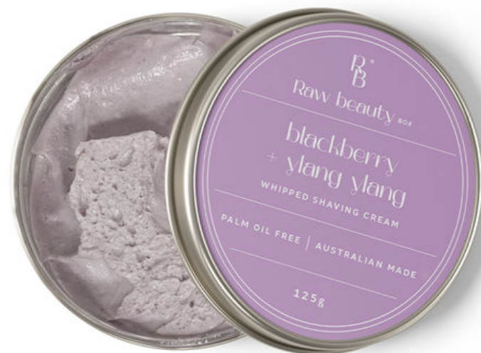
BLACKBERRY YLANG YLANG