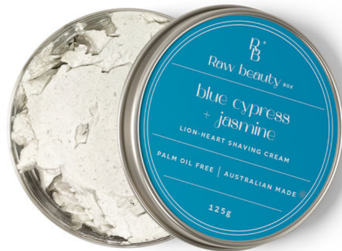
BLUE CYPRESS + JASMINE