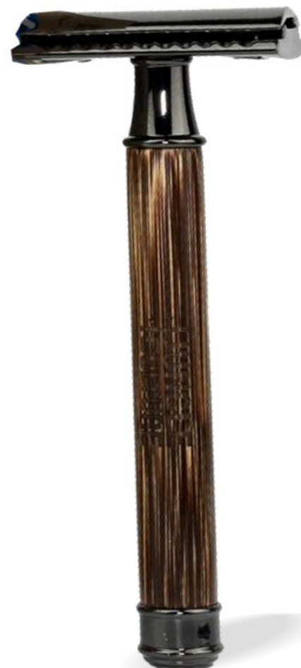
DARK BAMBOO STAINLESS STEEL SAFETY RAZOR