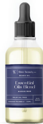
ESSENTIAL OILS BLEND BEARD OIL