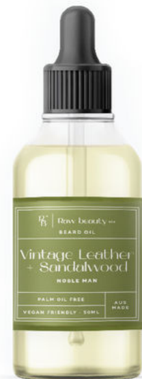
VINTAGE LEATHER + SANDALWOOD BEARD OIL