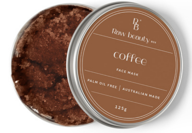
COFFEE FACE MASQUE