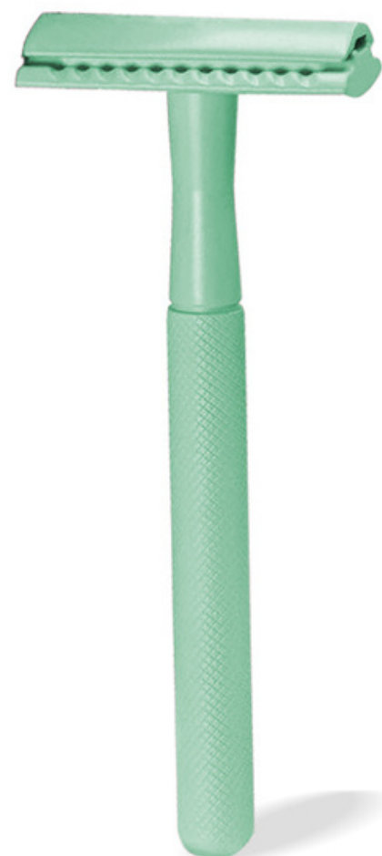
MINT STAINLESS STEEL SAFETY RAZOR