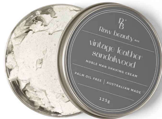
VINTAGE LEATHER + SANDALWOOD