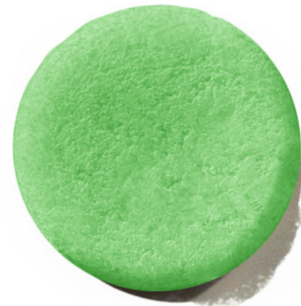
APPLE AND SAGE SOLID SHAMPOO BAR