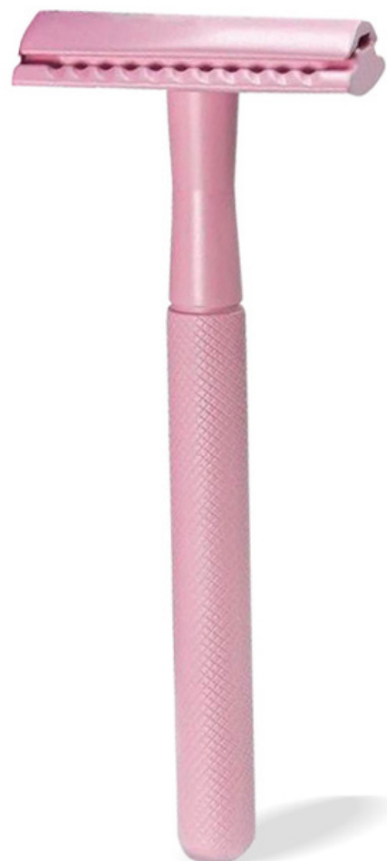
ROSE STAINLESS STEEL SAFETY RAZOR