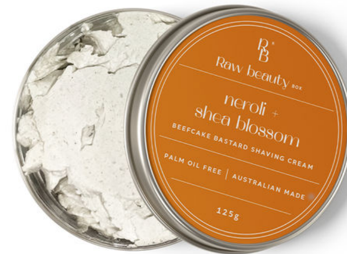
NEROLI + SHEA BLOSSOM