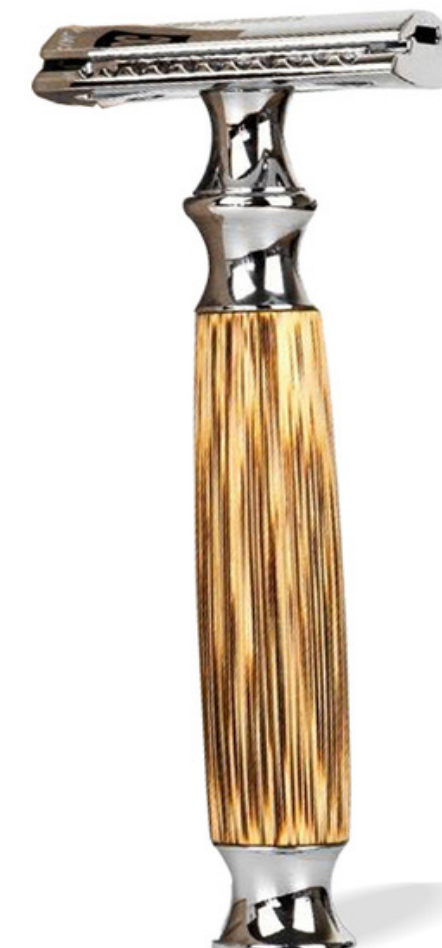
LIGHT BAMBOO STAINLESS STEEL SAFETY RAZOR