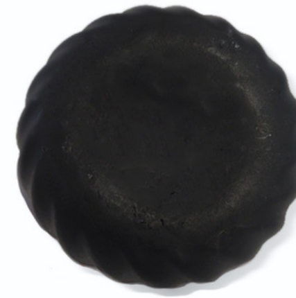
CHARCOAL FACE + BODY BAR