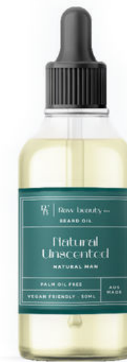
NATURAL UNSCENTED BEARD OIL 50ML