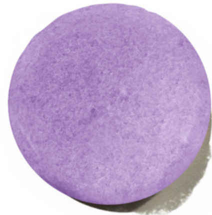
GRAPE BUBBLEGUM SOLID SHAMPOO BAR