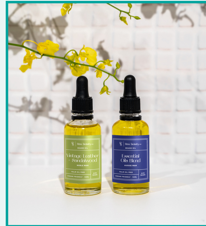
Shaving Cream Beard Oils & Sustainable Razors