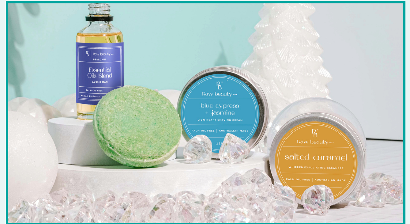
Gift Boxes & Pamper Packs