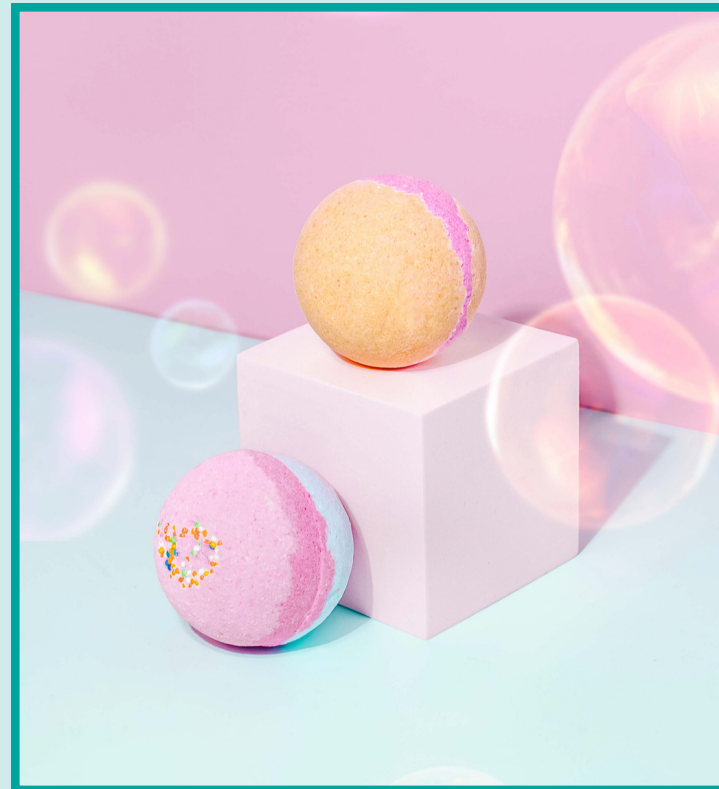
Bath Bombs & Dust Sachets