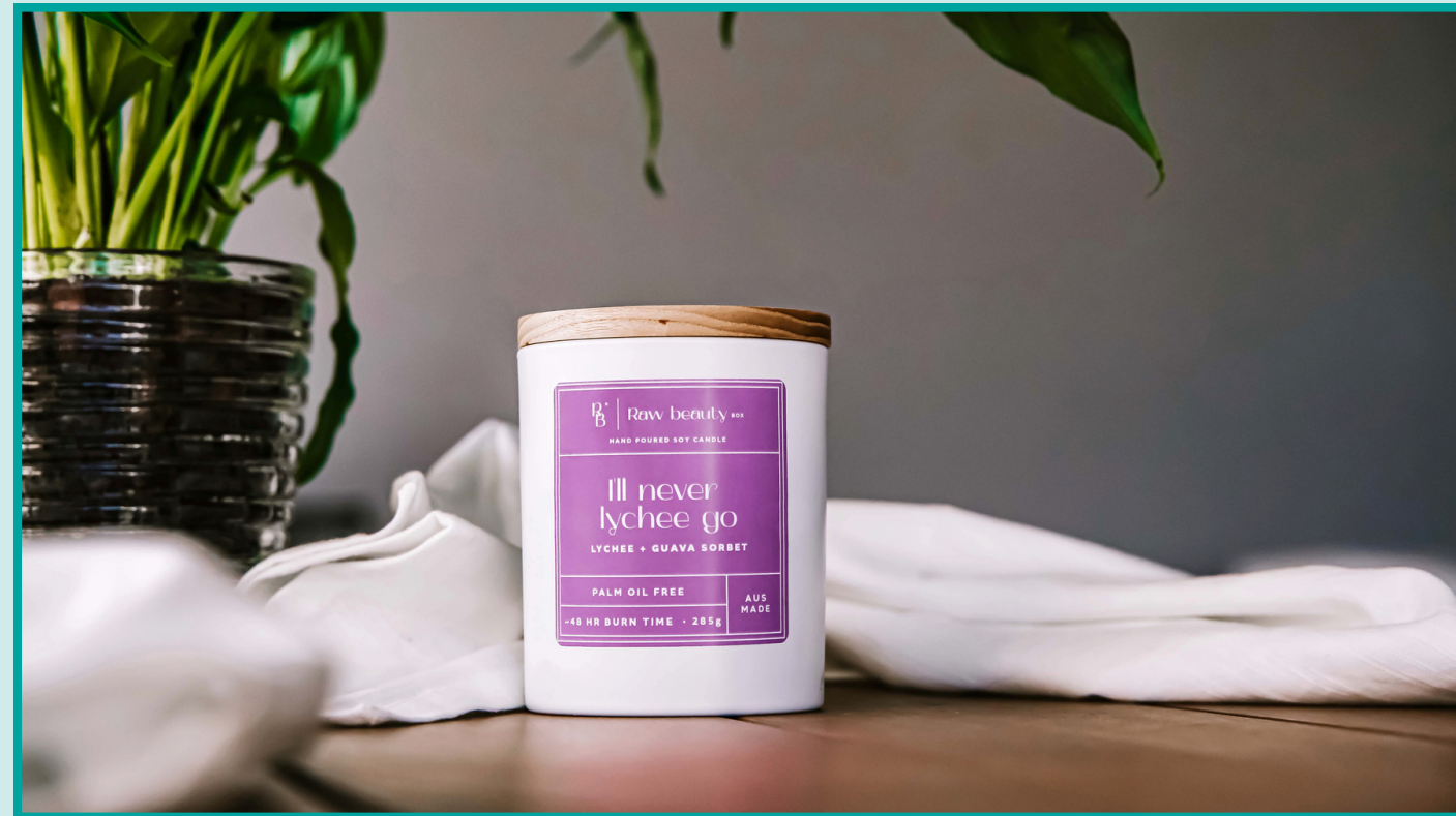
Candles & Wax Melts