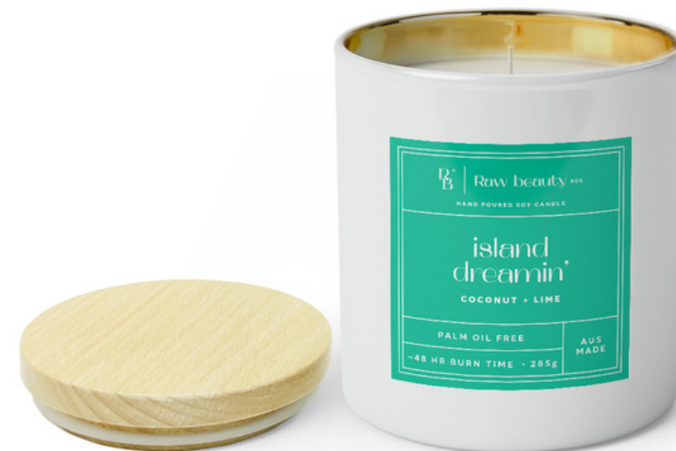
COCONUT + LIME