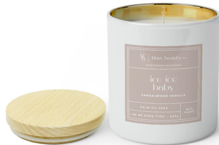
SANDALWOOD + VANILLA