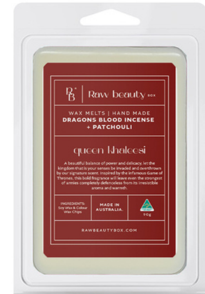
DRAGONS BLOOD INCENSE + PATCHOULI