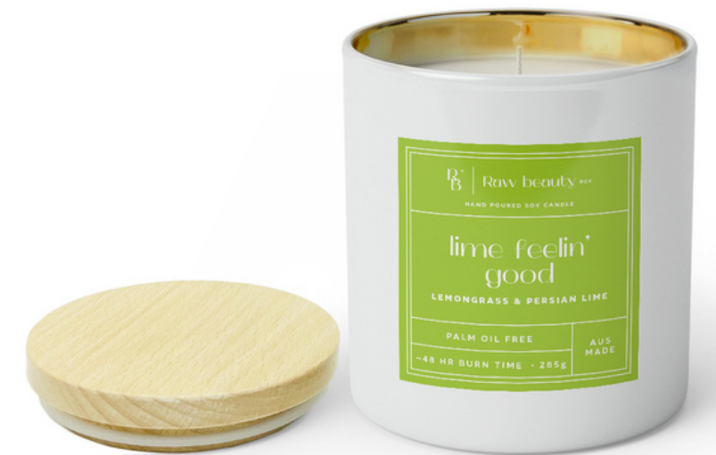
LEMONGRASS + PERSIAN LIME