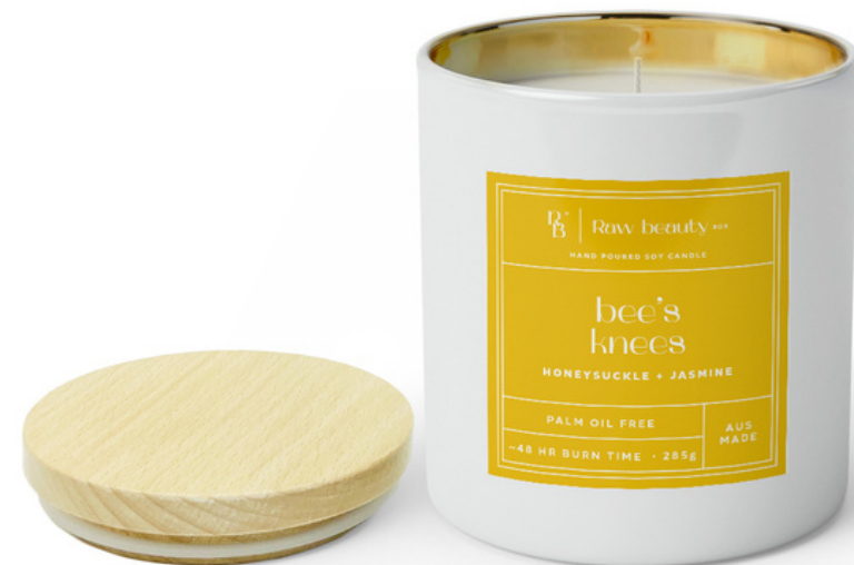
HONEYSUCKLE + JASMINE