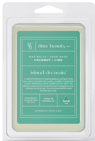
COCONUT + LIME