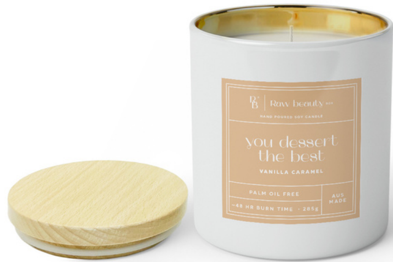
CARAMEL + VANILLA