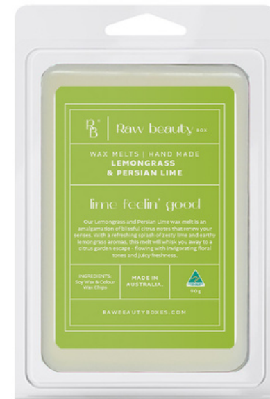
LEMONGRASS + PERSIAN LIME