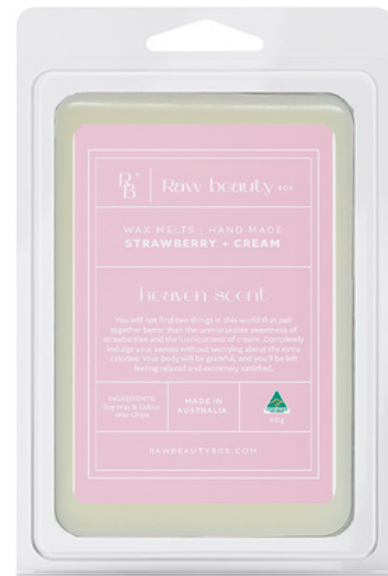
STRAWBERRIES + CREAM