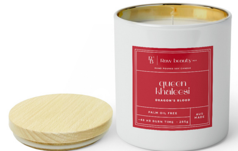
DRAGONS BLOOD INCENSE + PATCHOULI