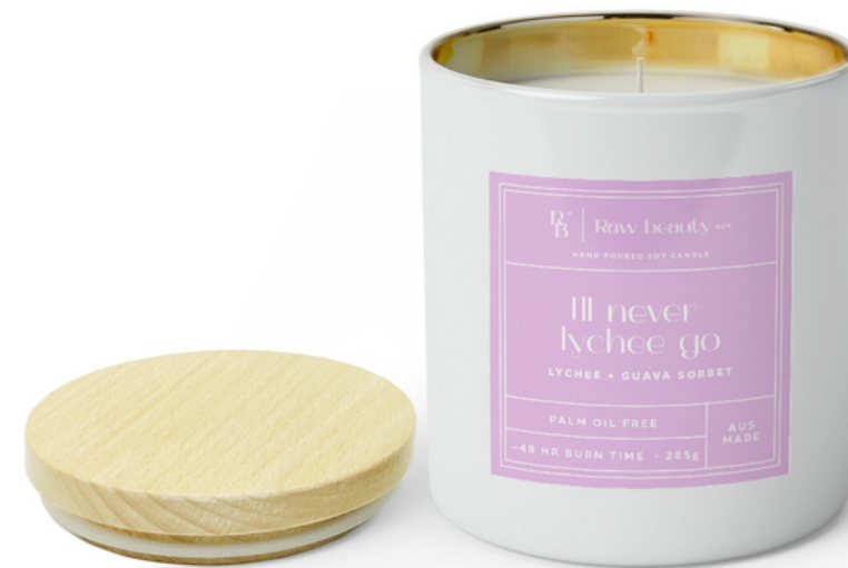
LYCHEE + GUAVA