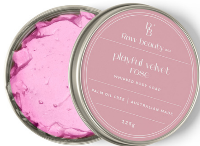
PLAYFUL VELVET ROSE