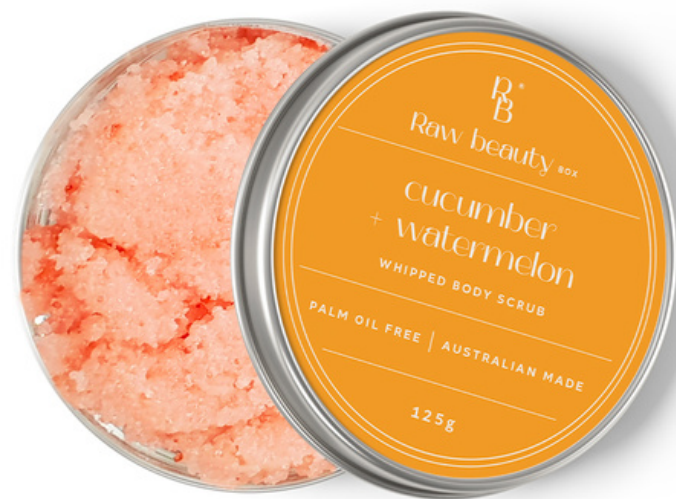
CUCUMBER + WATERMELON