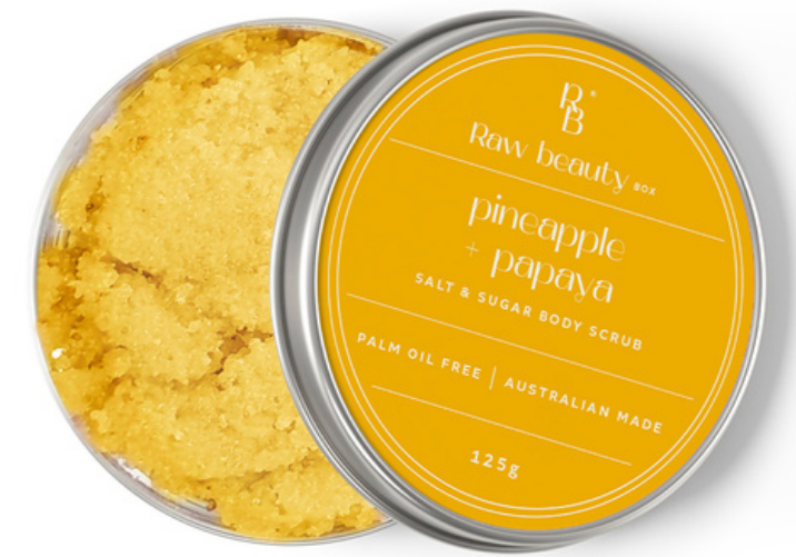
PINEAPPLE + PAPAYA