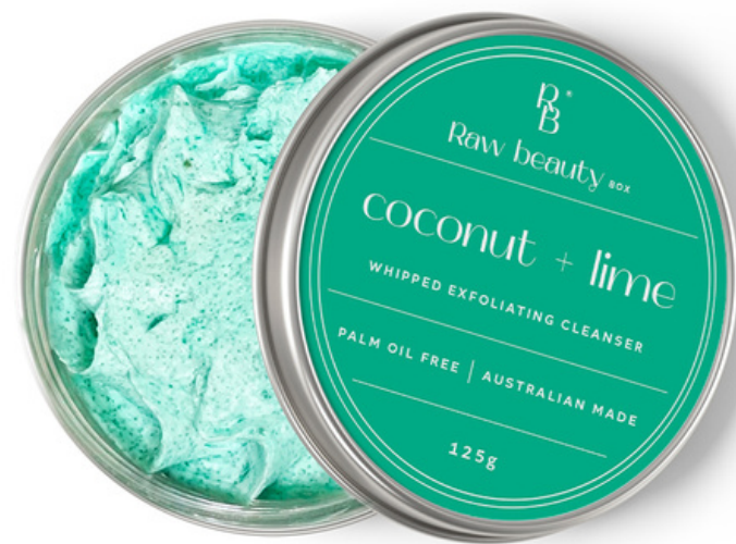
COCONUT + LIME