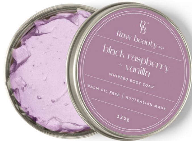
BLACK RASPBERRY + VANILLA