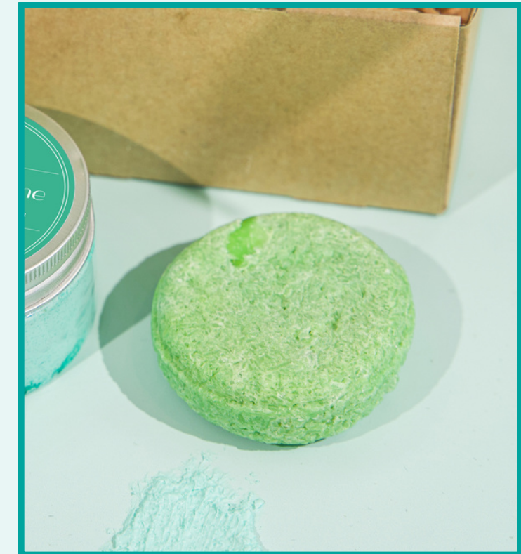
Shampoo Bars & Face/Body Bars